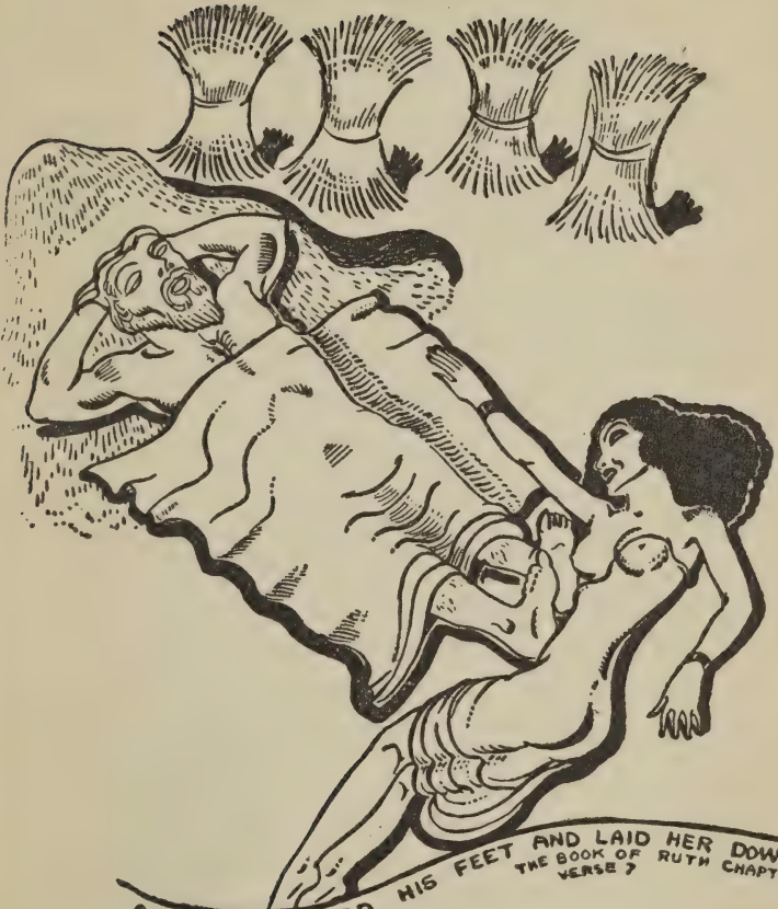
AND UNCOVERED HIS FEET AND LAID HER DOWN THE BOOK OF RUTH CHAPTER 3 VERSE 7